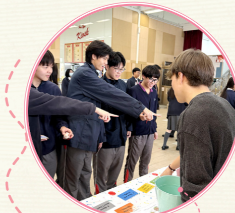
Precision & Proverbs Drill