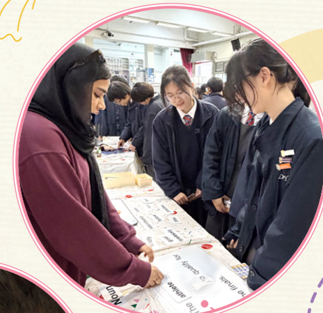
Parts of Speech S+V+O