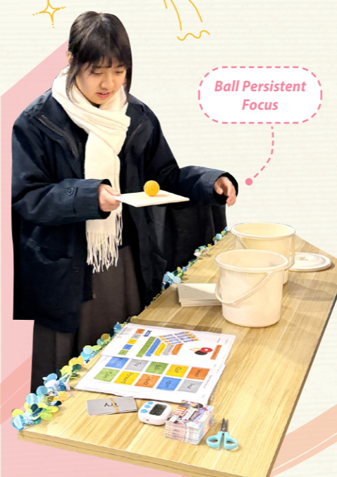
Ball Persistent Focus