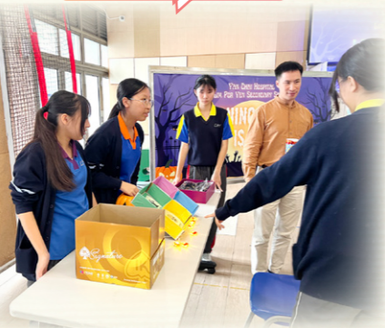
Toss the ball