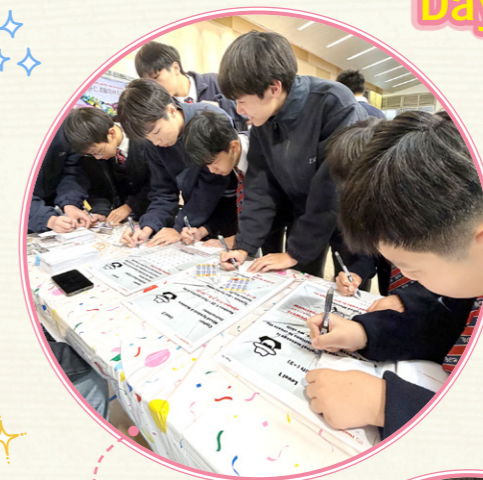
Meticulous Message Decoding