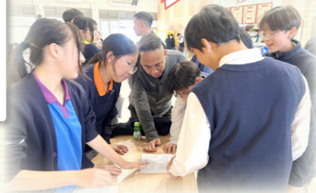
21 st Nov 25- Charades