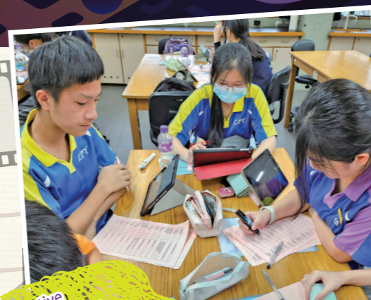
Cooperative learning in groups using technology