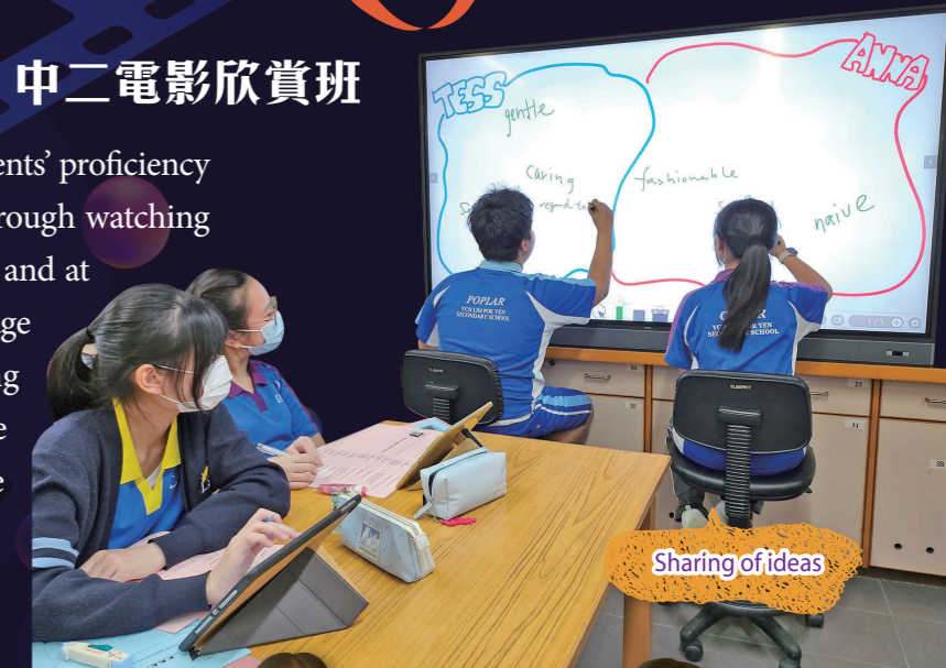
Sharing of ideas

The elite programme aims at developing students' proficiency in speaking and listening in the use of English through watching movies. Students enjoy different genres of movies, and at the same time, learn about the usage of the language in talking about cinema through viewing, playing games and participating in a variety of interactive activities. It is also hoped to stimulate and provoke students' thoughts and creativity.