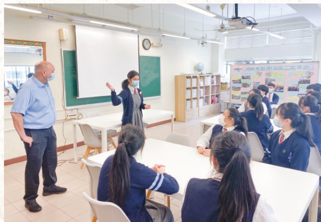
Students are trained to present with confidence.