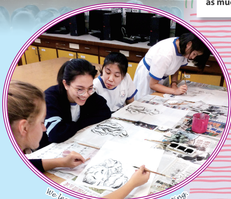
We learn by sharing and appreciating.