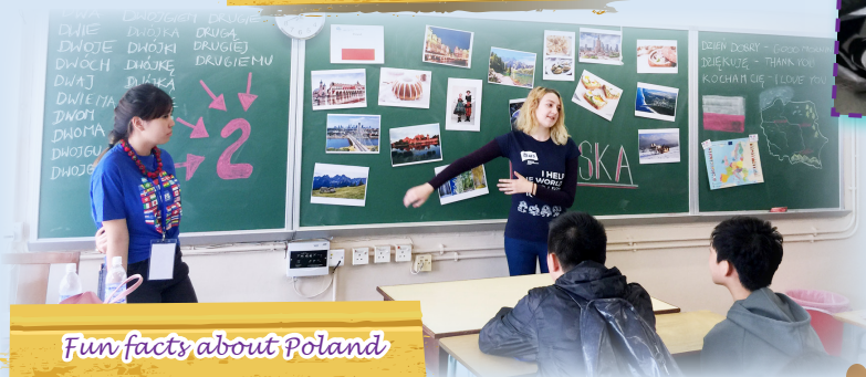
Fun facts about Poland