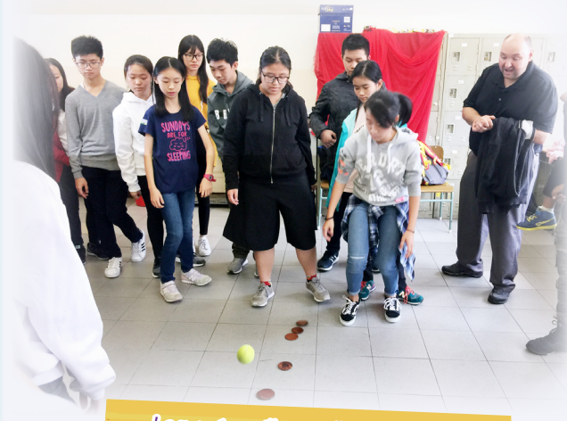
Learning through games - Pakistan style!