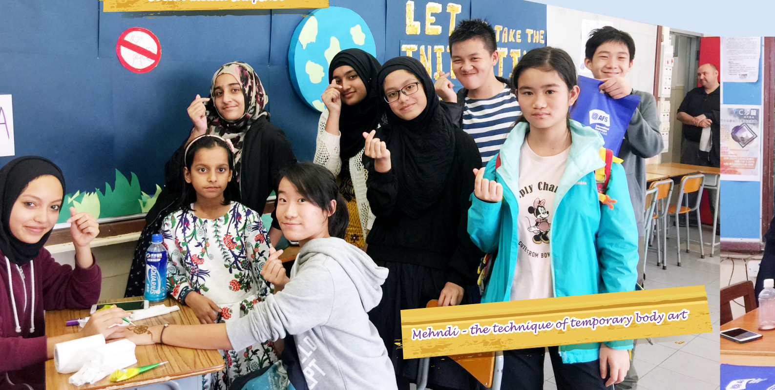
Mehndi - the technique of temporary body art