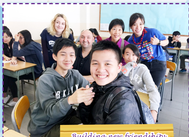
Building new friendships