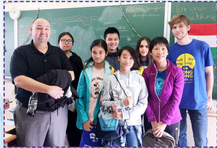
Hanging out with Hungarians

Each classroom was converted into a "mini embassy" where natives from other countries gave presentations about their homes. Countries from all over the world were represented, including Switzerland, Germany, Taiwan, Mexico, and Pakistan! It was a great opportunity for LPY students to reach out and participate in their community.