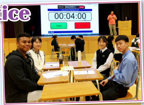
Hard work and dedication

The Joint School Oral Practice, held on a Saturday in January this year at Cumberland Presbyterian Church Yao Dao Secondary School, was a huge success. Practising group discussion for the DSE is difficult, but students had a great time working with their peers from other schools around Hong Kong. Following the practice session, two NET teachers briefly spoke about how well the students performed, and gave suggestions on how to improve their speaking skills in the future.