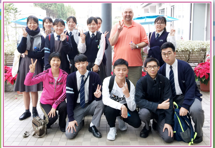
On a journey of success!