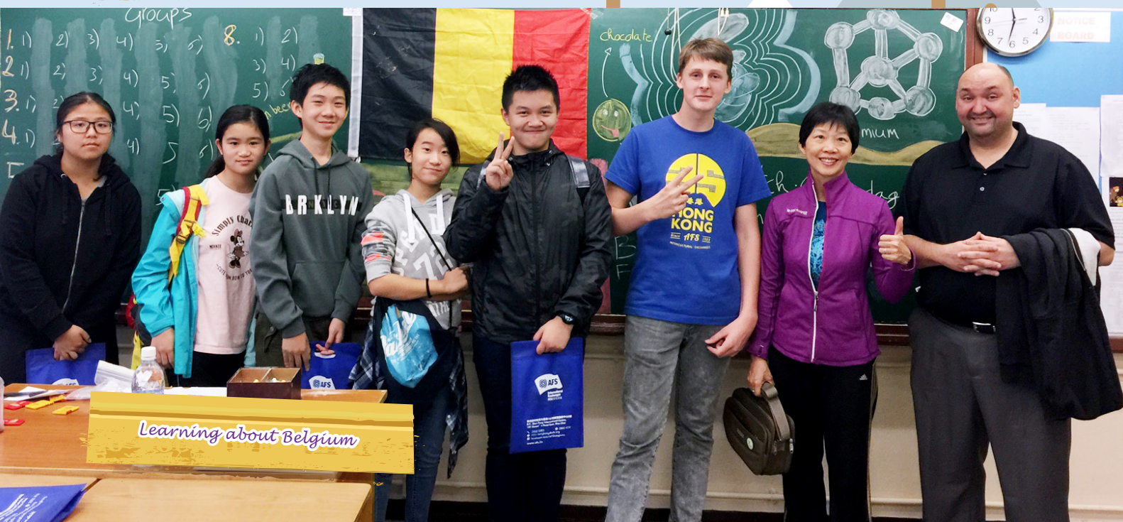
Learning about Belgium