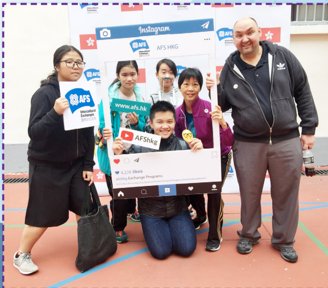
Social media snapshot