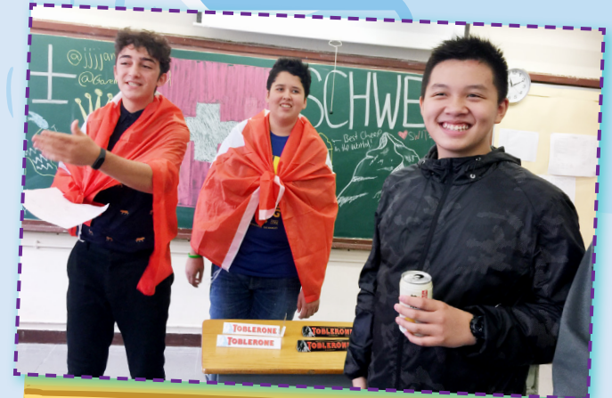
Switzerland...new friends, mountains and chocolates!