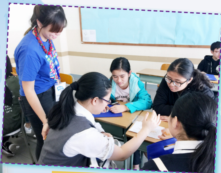
What's the answer? Quiz fun!