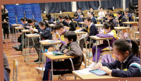
All competitors are typing out the vocabulary onto the iPads.