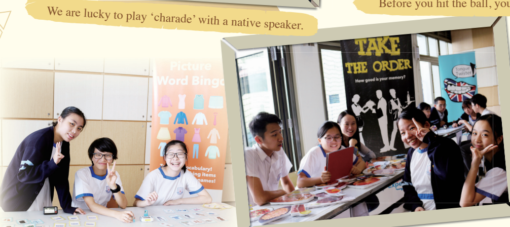
Come and challenge yourself with the bingo game.