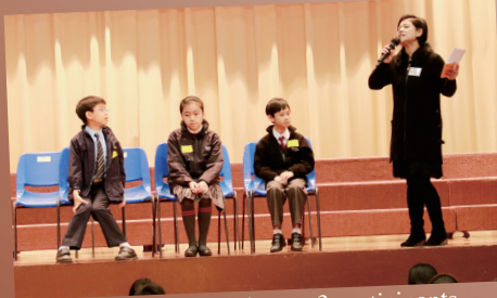
A big applause to the top 3 participants.