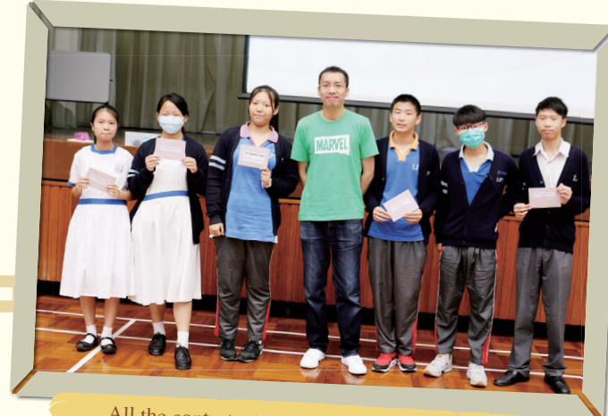
All the contestants were good public speakers.