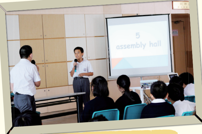
Team work is important to win the game.