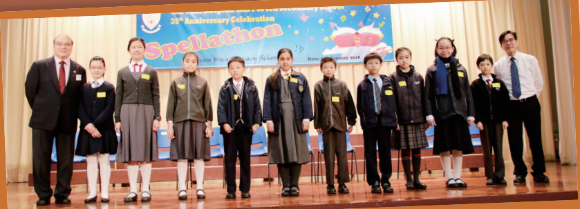
The top 10 participants