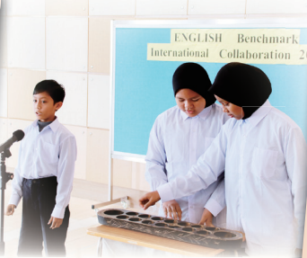
What a lively introduction!

On 14 December 2017 students from several schools in Malaysia visited LPY in order to participate in the English Benchmark International Collaboration. The storytelling competition was very entertaining. The wellrehearsed Malaysian students had the audience laughing and cheering with their hilarious and compelling performances. Our own LPY students had their moments to shine as well, performing the choral speaking piece they had learned earlier in the school year. It was a great opportunity for both performers and the audience to share in a multicultural experience.