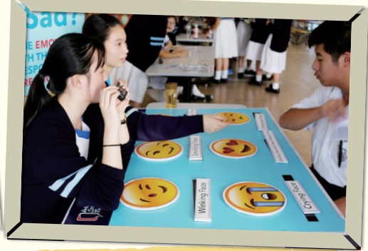
Do you know how to describe these emoji expressions in English?