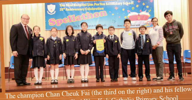
schoolmates from Chai Wan Kok Catholic Primary School