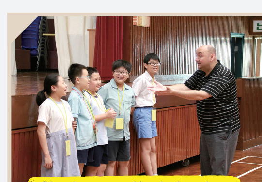
S1 students are catching the drama bug.

Due to the creativity and hard work of the Form 1 students, the Learning English through Drama class was a great success. Students completed the class with a greater sense of confidence in speaking and writing English, and became more familiar with their new secondary school.