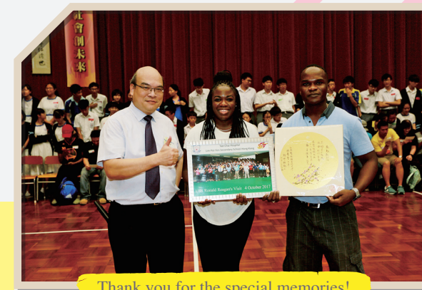
Thank you for the special memories!