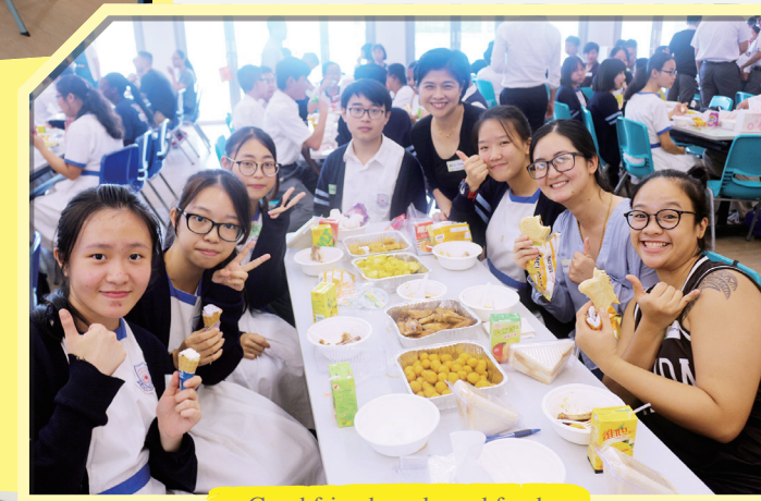
Good friends and good food.