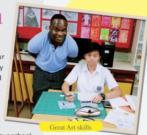
Great Art skills

After such a successful event, we can all feel confident that LPY is ready and able to interact on the world stage with success and confidence. We look forward to the next opportunity to reach out and engage with new cultures and new learning experiences!