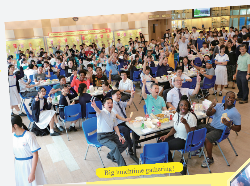
Big lunchtime gathering!