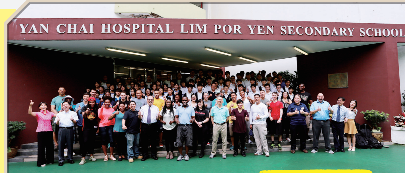
USS Ronald Reagan Visit 2017