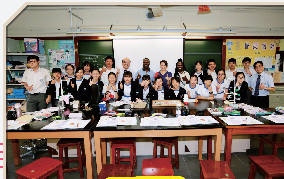
Thumbs up, everyone!