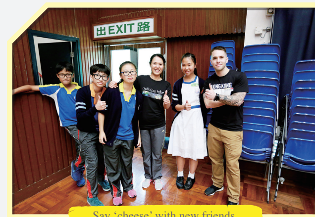
Say 'cheese' with new friends.