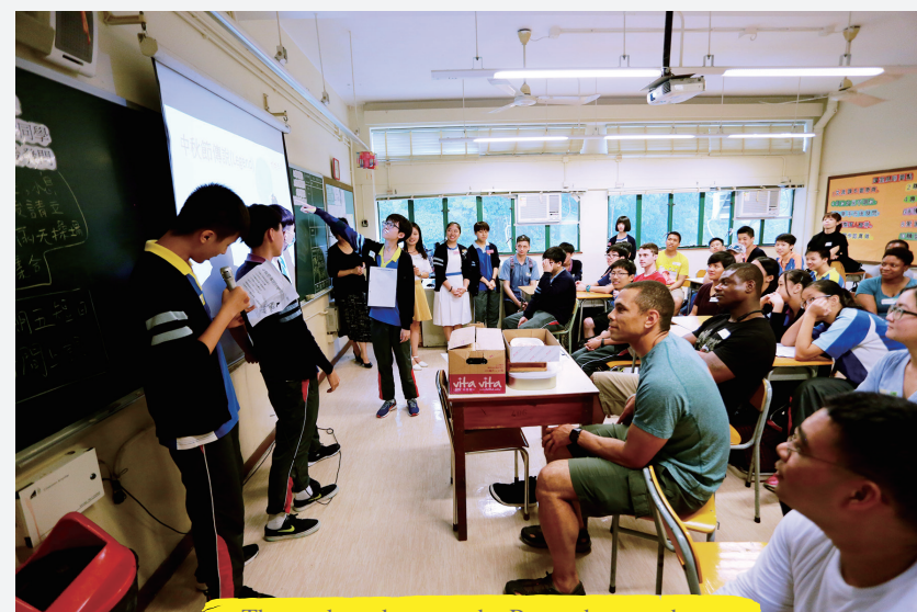
The students become the Putonghua teachers.