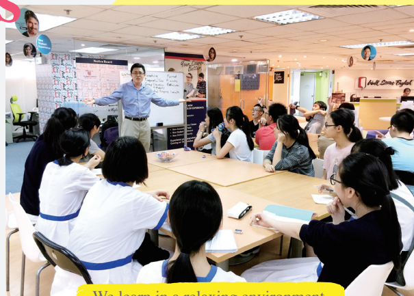
We learn in a relaxing environment.

Our students are always grateful for the extracurricular opportunities that LPY Secondary School brings to them. It was very encouraging to note that our students approached the Wall Street English lessons with excitement and a serious commitment to use their time wisely. By taking advantage of these enrichment activities, our students will grow into ever more inquisitive and active learners!