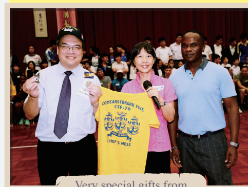
Very special gifts from the USS Ronald Reagan