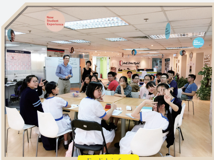
English is fun.