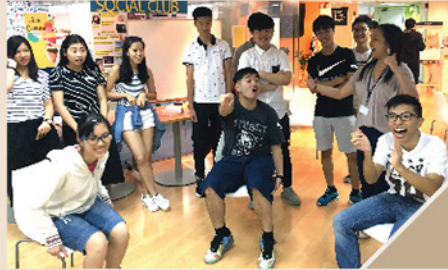
Playing language games is really funny.

Thanks to a generous grant, some students of YCHLPY Secondary School were able to take advantage of extracurricular English learning at the Wall Street English language center. Using conversation, games, and other fun learning activities, the teachers at Wall Street English language center helped students improve their spoken English skills. The program is so popular because it really works!