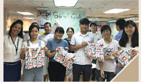
Our game winners are so proud of their hard-earned prizes.