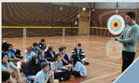
We are joining the PE lesson at Bayswater Secondary College.