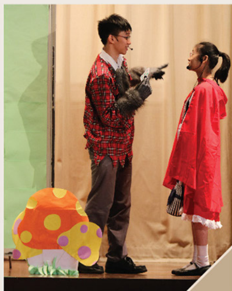
The Big Bad Wolf is chatting with Little Red Riding Hood.