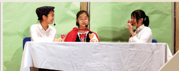
Little Red Riding Hood is having a peaceful breakfast with mum and dad.

For the 2015-2016 school year, the YCHLPY Secondary School Drama Team produced a humorous version of "Little Red Riding Hood." The hard work of the students paid off! The production was quite a success, with many congratulations from LPY students and staff. The drama team is already hard at work, planning for a new production for the 2016-2017 season!