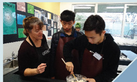
Our boys are having cookery lesson.