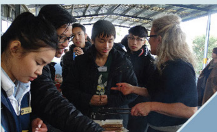
The barbecued sausages are so mouth-watering.