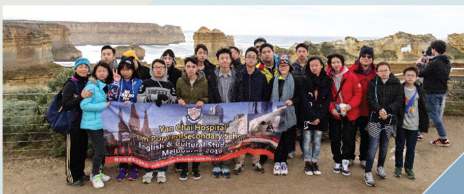
Group photo at Twelve Apostles

A group of very fortunate students and teachers had a remarkable journey over the summer. The group travelled to Melbourne, Australia, where they had the opportunity to live with local Australian families. Students had the golden chance to improve their English and their social skills, and to learn about authentic Australian culture.