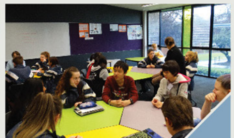
Integration Class is interactive.