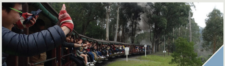
Puffing Billy Train ride is so exciting