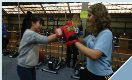
Fitness lesson at Bayswater Secondary College