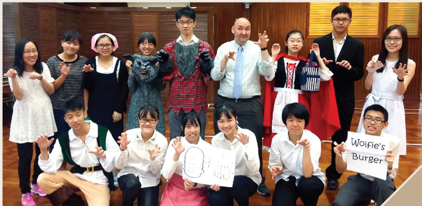
The Drama Team poses for a celebration snapshot!

For the 2015-2016 school year, the YCHLPY Secondary School Drama Team produced a humorous version of "Little Red Riding Hood." The hard work of the students paid off! The production was quite a success, with many congratulations from LPY students and staff. The drama team is already hard at work, planning for a new production for the 2016-2017 season!