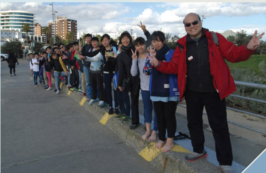
The scenery at St Kilda Beach is captivating.