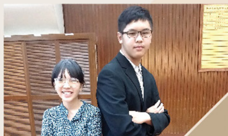
Drama: Hard work, but lots of fun!