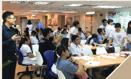
Everyone is engaged in the interactive game.