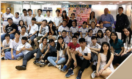
Group photo with Yan Chai No. 2 Secondary School after the fun-filled lessons