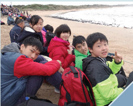
We are waiting for the penguins to come home.