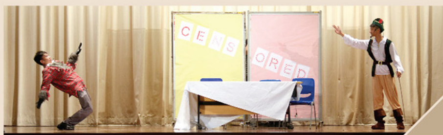
Real danger or spectacular special effects?