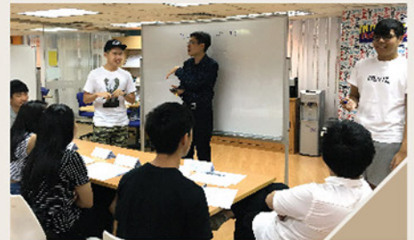
The idiom exercise is so interesting.