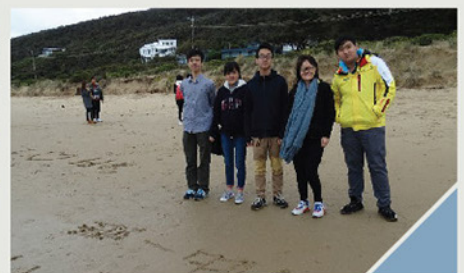
We have been to the beach at Great Ocean Road!