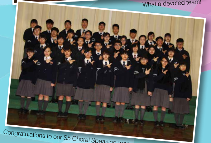
Congratulations to our S5 Choral Speaking team.