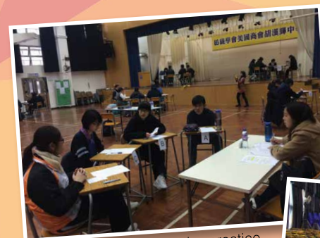
Our students are having the practice with the students of TIACC Woo Hon Fai Secondary School at their school.

Having the chance to practise with students from a different school provides an opportunity to hear different voices, different opinions, and different ideas. It is also a great way for students to meet new friends, and learn more about their community.