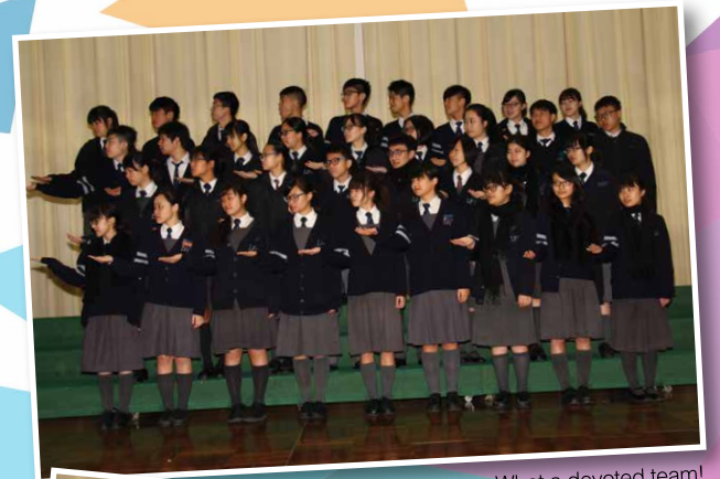
What a devoted team!

The day of the competition was very fun. The students and teachers rode a big bus to downtown Tai Po Civic Centre, where the competition was being held. It was very educational to see how the other schools performed the same poem, again and again. It seemed that there were many ways to interpret the mood and the meaning of the famous poem. Of course, the best part was taking the third-place win!