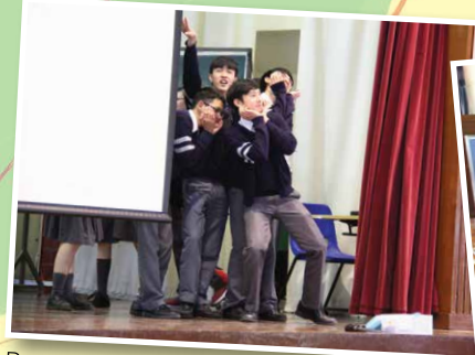
Do you agree that we are talented actors and actresses?