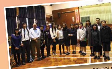
Students and teachers from our school and Hong Kong Teachers' Association Lee Heng Kwei Secondary School.