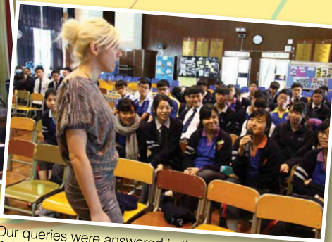
Our queries were answered in the Q & A session.