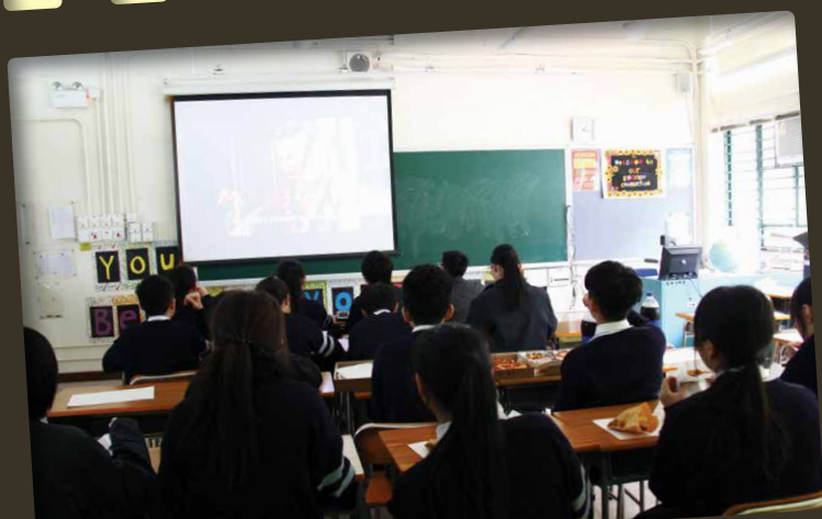
Pizzas and coke add extra taste to the film 'Ella Enchanted'.

There is a wide variety of movies shown, covering almost every genre. This is a great opportunity to hear native English speakers, and to be entertained at the same time. Students are allowed to enjoy their lunch as they view the movie. However, they are asked to be careful, and to clean up afterwards. How exciting! A movie with your lunch! Be sure to drop by, and bring your friends along!