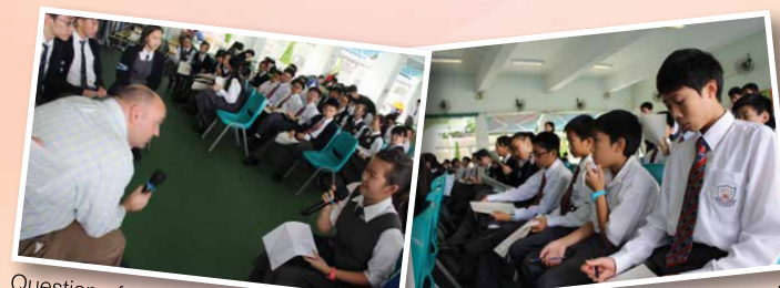
Questions from the audience are welcome.