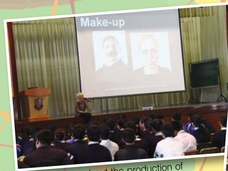
We knew more about the production of a drama after the workshop.

Students were engrossed in the timeless story, and also learnt to value the great skill and effort that go into staging a professional, theatrical performance. This is an exciting and invaluable opportunity to enrich learning through exposure to the theatre.