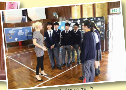
We enjoyed the fun activities so much.