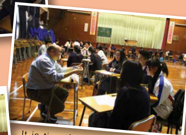
It is time for comments which help students recognize their areas of improvements and do better next time.