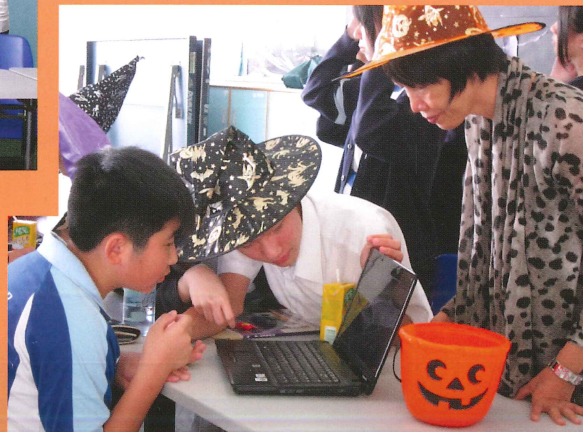
It's fun to share, not time to scare.

LPY's 2012 Halloween celebration went digital! This year, we turned on our laptops and played a variety of online English Halloween games. From 'hangman' to 'skeleton toss', we enjoyed each other's company, dressing up in witches' hats, eating candy and hanging out with our English teachers. Fun had by all!