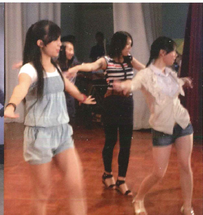
High School Musical (LPY Version) / Dancing practice before the show