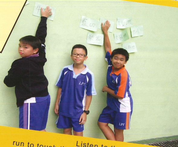
Listen to the question and run to touch the correct answer on the wall.

Like everything in life, it is always a good idea to take a new approach, and that is what S1 students have done with learning English! Instead of sitting in the classroom, they took to the Playground and Covered Playground to learn English through games. Much singing, brainstorming and activity took place as students brushed up on their conversation skills, learned the school song, and gained confidence through speaking English in a more relaxing and fun way.