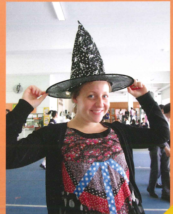
Am I cool?