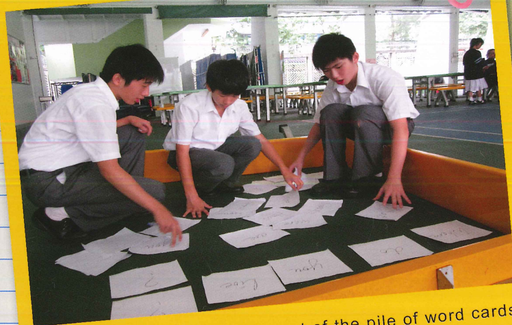
Let's make sense out of the pile of word cards.