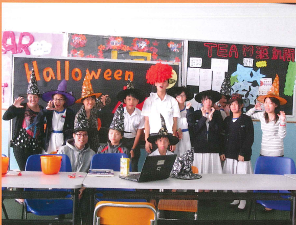
Are they scary?

LPY's 2012 Halloween celebration went digital! This year, we turned on our laptops and played a variety of online English Halloween games. From 'hangman' to 'skeleton toss', we enjoyed each other's company, dressing up in witches' hats, eating candy and hanging out with our English teachers. Fun had by all!