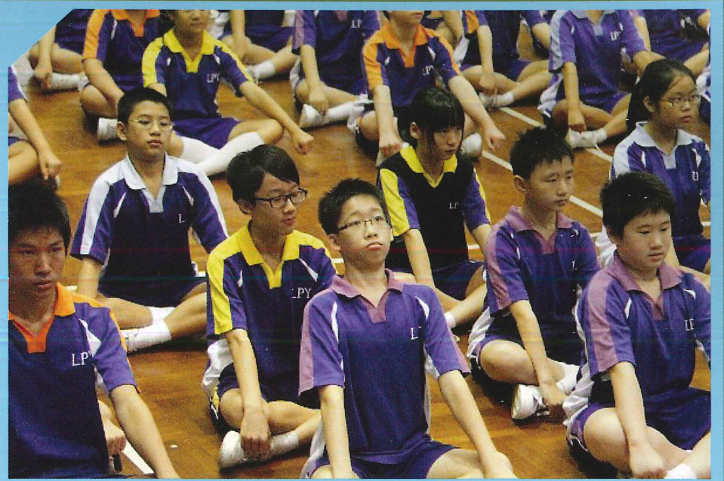
The new students are having discipline training.

The closing ceremony for the course was held on August 19th, 2012. All participants gathered to perform a special march for parents and teachers. It was a memorable moment for parents and children as our ceremony displayed how dedicated students were to making a successful merge into their secondary education, and becoming part of our big family at LPY.