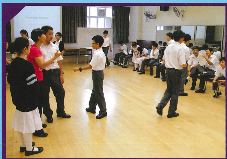
1CD students are doing Running Dictation, passing the message to their partner writers.

A former student of LPY has been invited to co-teach S1 C D class once per cycle. Our new assistant teacher is physically fit, athletic and experienced in teaching Learning English through Sports Communication. Students will play English games, competing in teams of four to six. The element of sport is integrated to add fun, excitement and team spirit to the learning activities.