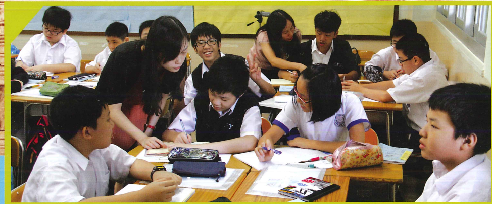
1C and 1D students are communicating with each other in the Cooperative Learning Workshop.