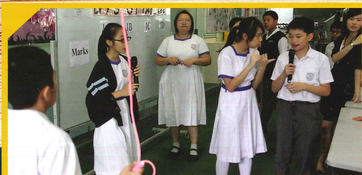
To win the game, students are required to cooperate with one another.