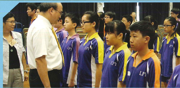
Inspection of the students' formation by the Principal