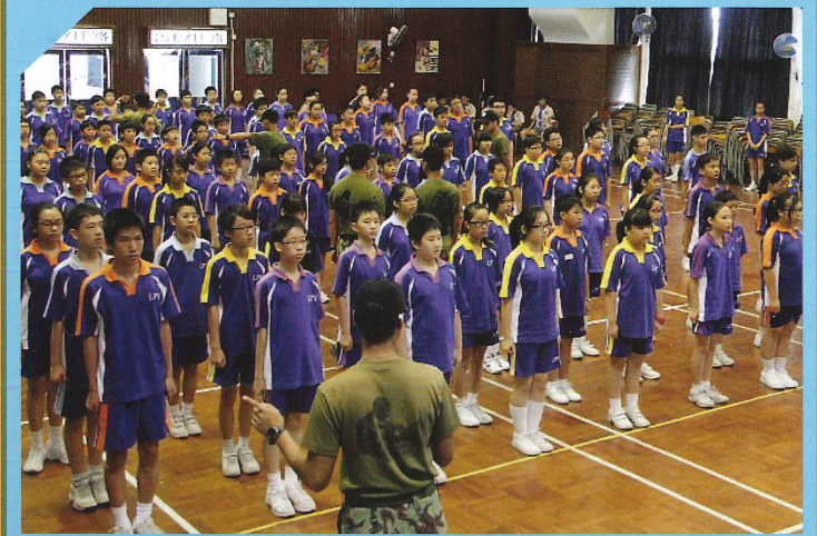
They are new members of our big family.