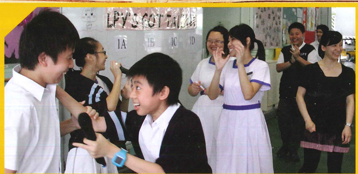
LPY's Got Talent is an extremely entertaining game. All of us are laughing.