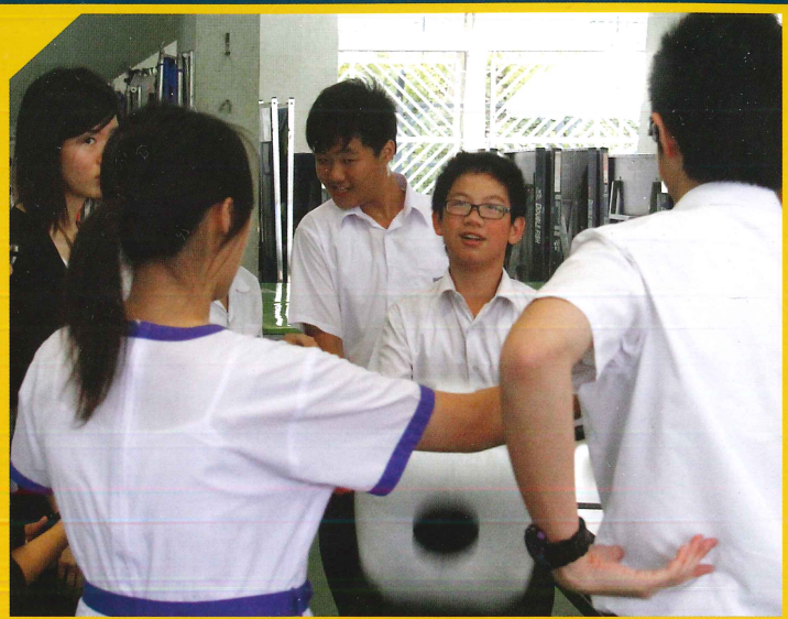
The most important moment - Rolling dice! The number thrown will be added to the total marks.

Learning English is fun as we have an enjoyable and entertaining activity, LPY's Got Talent. It is a lunchtime activity in which inter-class competitions are organized for S1. The game is designed to maximize students' exposure to learning English in a relaxing environment and to serve as a platform for revising learnt topics. Questions are closely related to the curriculum. The first LPY'S Got Talent was held on 28th February 2011. As English is used as the medium of instruction for teaching Mathematics, the game was designed to help students re-visit the application of the Mathematics formulaic expressions '+', '-', 'x' and '÷'. It is definitely an entertaining and educational activity. In addition, we also build up students' spelling ability through playing "bowling". Students were given tennis balls. Their goal was to throw the balls and hit one bottle. After that, students were asked what the picture was and spelt the word. In order to make the game become more challenging, two representatives from each class were invited. Two minutes were given to each class. One student skipped the rope while the other student named different kinds of food. It was really a thrilling game.