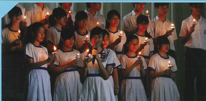
A performance by 5A to welcome the new students