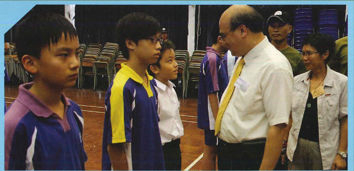
A warm welcome from the Principal